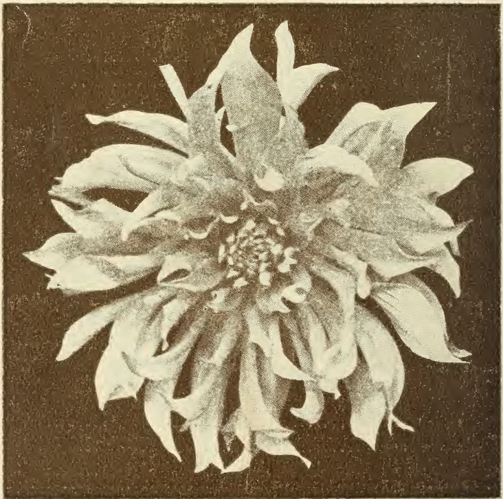
YELLOW KING (See Page 7)